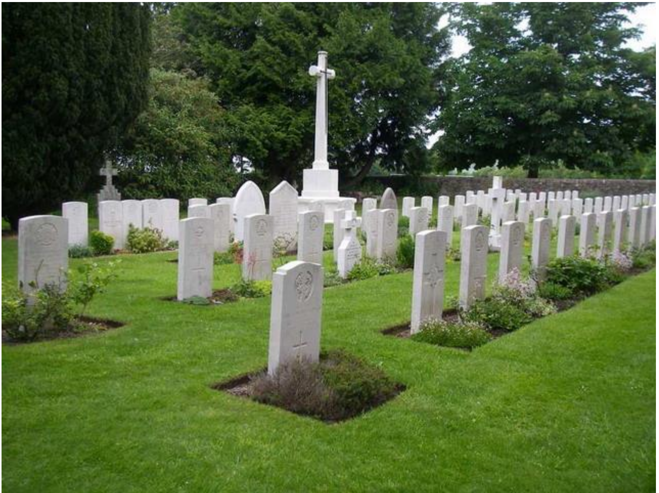
War Graves at Sutton Veny